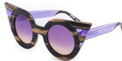
DFG.C2.PR RAZZ MATERIAL: ACETATE LENS: GRADIENT PURPLE- BROWN 100% UV PROTECTION AR COATED