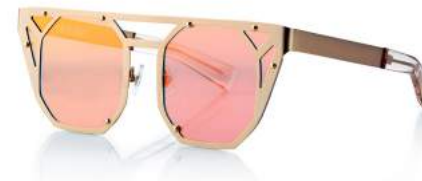
DH.C3.RBY RUBY ROSE MATERIAL: GOLD STAINLESS STEEL SATIN GLOSS LENS: FLAT PINK MIRROR 100% UV PROTECTION AR COATED