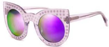
DML.7669.T TRANSPURPLE MATERIAL: ACETATE LENS: PURPLE MIRROR 100% UV PROTECTION