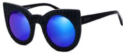
DML.01.BL BON BLUE MATERIAL: ACETATE LENS: BLUE MIRROR 100% UV PROTECTION