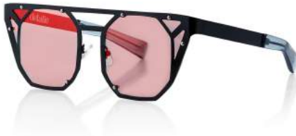
DH.C1.RD MYSTIC RED MATERIAL: BLACK STAINLESS STEEL SATIN GLOSS LENS: FLAT RED MIRROR 100% UV PROTECTION AR COATED