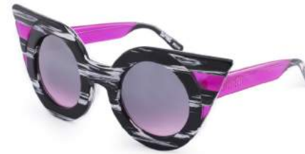
DFG.C1.PK GLIMMER MATERIAL: ACETATE LENS: GRADIENT PINK- SILVER MIRROR 100% UV PROTECTION AR COATED