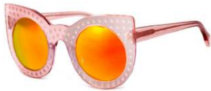
DML.202.PG GLITTER MELON MATERIAL: ACETATE LENS: ORANGE MIRROR 100% UV PROTECTION