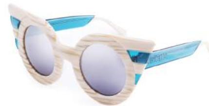
DFG.C3.TQ SWIFT MATERIAL: ACETATE LENS: SILVER MIRROR 100% UV PROTECTION AR COATED