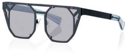
DH.C1.BLK BLACK SATIN MATERIAL: BLACK STAINLESS STEEL SATIN GLOSS LENS: FLAT MATT BLACK MIRROR 100% UV PROTECTION AR COATED