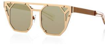
DH.C3.GLD BLAZE GOLD MATERIAL: GOLD STAINLESS STEEL SATIN GLOSS LENS: FLAT GOLD MIRROR 100% UV PROTECTION AR COATED