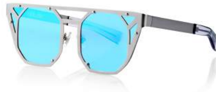
DH.C2.BU OCEAN FROST MATERIAL: SILVER STAINLESS STEEL SATIN GLOSS LENS: FLAT BLUE GREEN MIRROR 100% UV PROTECTION AR COATED