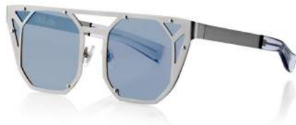
DH.C2.SVR SILVERBURST MATERIAL: SILVER STAINLESS STEEL SATIN GLOSS LENS: FLAT SILVER MIRROR 100% UV PROTECTION AR COATED